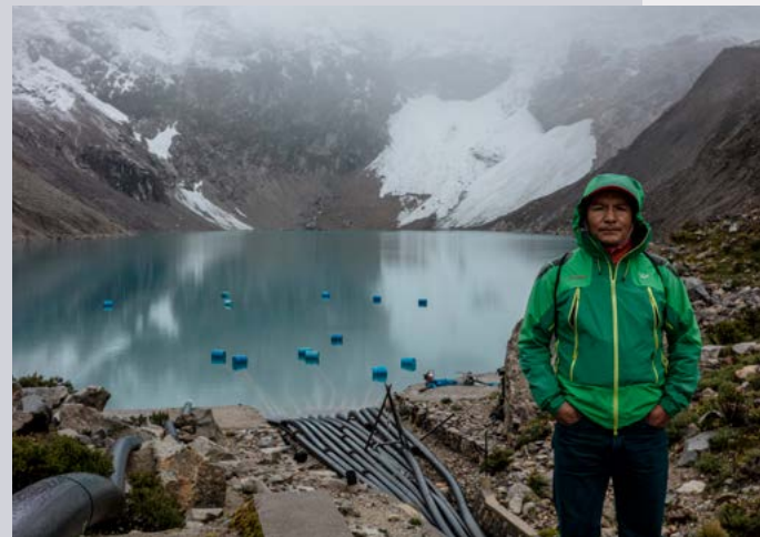
The glacier lake Palcacocha is currently equipped with a provisional pumping system, which is not sufficient to prevent a dangerous flood wave.